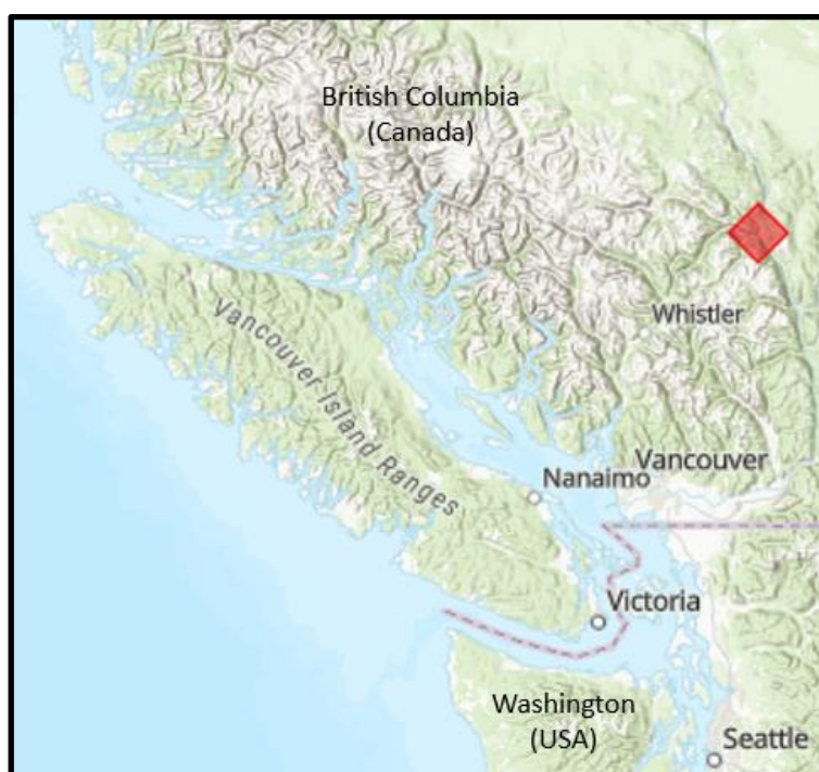
Figure 1- Map of Southwestern British Columbia, indicating the general location of the study area in red.

The study area is located in southwestern British Columbia, Canada, east of Lillooet in the Pavilion Ranges Ecoregion (Figure 1). In the past, the area has experienced a relatively frequent fire return interval (6.6 to 11.6 years over the last 500 years), of regular low-intensity surface fire within fire resilient, open forest areas of Douglas Fir and Ponderosa Pine stands, and less frequent fire occurrence in higher elevation stands comprised of Montane Spruce and Lodgepole Pine (Gray et al., 2002). Over the past 100 years, largely as a result of aggressive fire suppression, the forests throughout the area have become less fire resilient with increased hazardous fuel load build-up, resulting in an altered fire regime of less frequent and more severe fires. In response to the increased fire risk, several areas throughout the territory have undergone fuel treatments, fire-smarting, and ecosystem restoration initiatives, including thinning and pruning, with a particular focus placed around community areas and recreation sites (Diver, 2016).